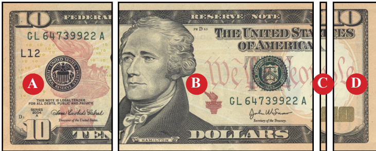
A: WATPA ($2.58); B: DOC ($6.16); C: DSHS JRA ($0.09) D: Criminal Justice General Fund Backfill ($1.18)

During the 2011-13 biennium, the Legislature has appropriated $5.9 million in funds for WATPA. The WATPA account is divided among WATPA auto theft task forces and funding for the Department of Corrections (DOC) and the Juvenile Rehabilitation Administration (JRA). Based on OFM projections through the end of the biennium, WATPA funding will be used to partially fund eight Task Forces, community outreach programs and administrative costs.