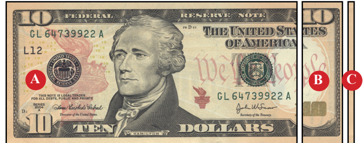
A: WATPA ($8.80); B: DOC ($1.08); C: DSHS JRA ($0.12)